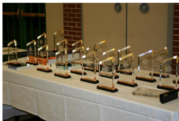
Trophies that were presented for the first time this year to scholarship and award recipients.