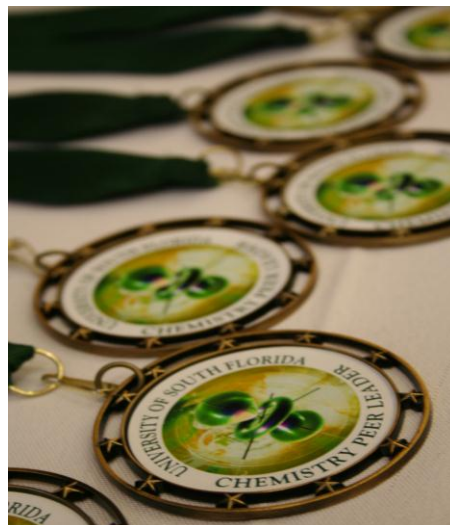
Close-up of medallions given to Peer Leaders or Honor Roll recipients

There are now about 20 named awards or scholarships, e.g., the Dr. Jesse S. Binford General Chemistry Award. Recipients received an appropriate book, as well a trophy and a scholarship ($200 or 250).