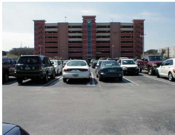
The Richard A. Beard Parking Facility at the corner of Alumni Dr. and Walnut Dr.

[See: www.ctr.usf.edu current information]