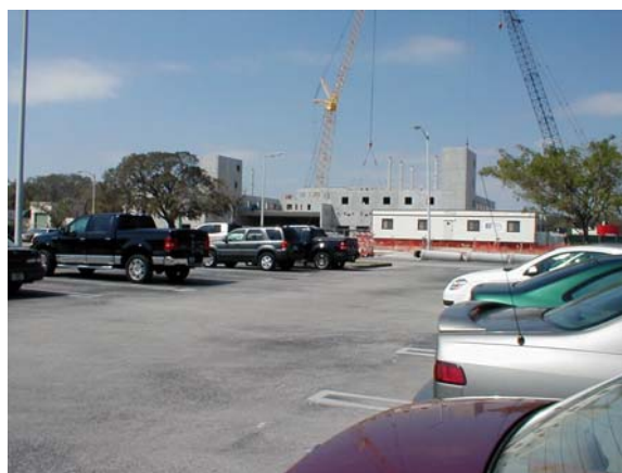
(early April )

Another change near the Science Center is Magnolia Hall and West Dining Hall, an undergraduate facility now under construction. Opening is scheduled for Fall Semester, 2009. The view is looking west from the Science Center parking lot.