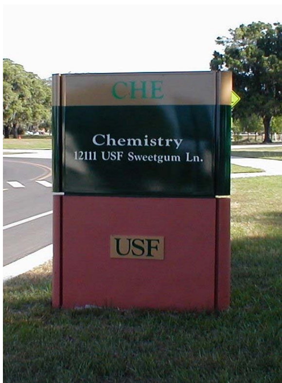
Sign near entrance to SCA parking lot

New numbers have appeared to identify specific buildings in case of fire. Chemistry is 12111. More specifically, our fire truck address seems to be 12111 Sweetgum Lane.