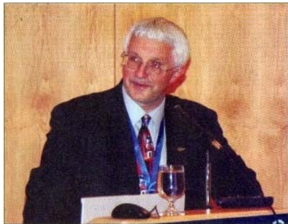
البروفيسور مايك زوروتكو أثناء محاضرته بمؤتمر طيبة للكيمياء.