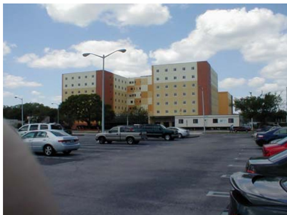
Magnolia dorms in early May

Opening is still scheduled for Autumn, 2009.