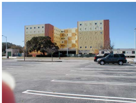
Magnolia dorms in early February

Construction of Magnolia dorms (located due west of the Science center) are coming along. What we can't decide is what the final color will be. The USF building colors seem to be rose and beige. And clearly you see the rose, but you also have the choice of