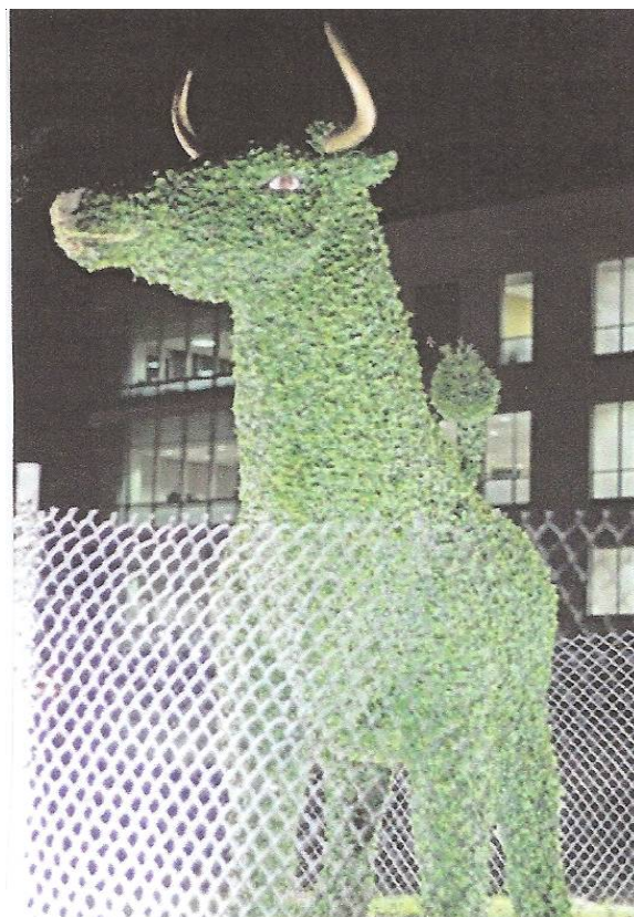
Mascot topiary on Crescent Hill, up close and personal (Courtesy Oracle, February 4, 2009).